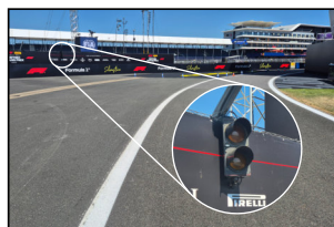
Pit Entry Road Signal