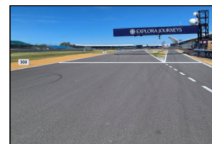
Safety Car Line 1