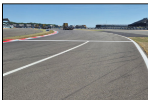
Safety Car Line 2