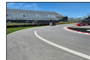
Safety Car Line 2