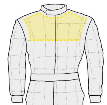
NOMEX TRACK SUIT EXAMPLE