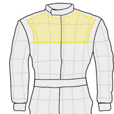
NOMEX TRACK SUIT EXAMPLE OR minimum 12cm horizontal OR 9cm stacked

Competitors may contact Michelin if adjustments needed.