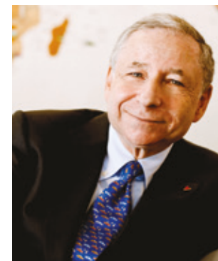
Jean Todt, President of the FIA:

So if you have any of these attributes, you too could be an Engineer.