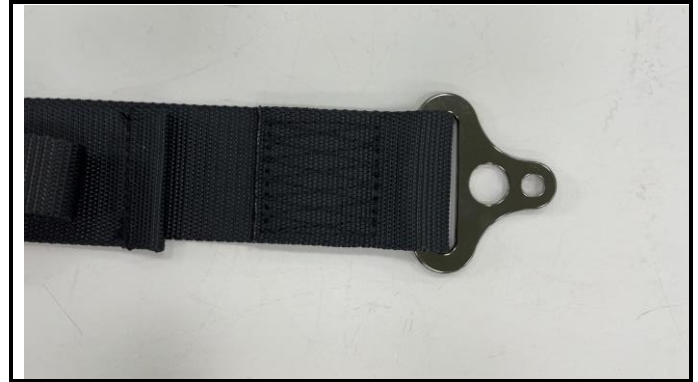
A1-4) Position / Position : Left Lap