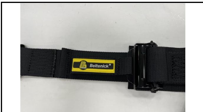
A2-3) Position / Position : Right Lap