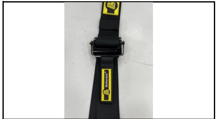
A2-2) Position / Position : Left Shoulder