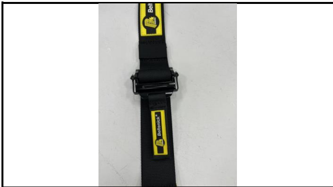
A2-1) Position / Position : Right Shoulder