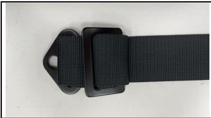
A1-5) Position / Position : Right Crotch