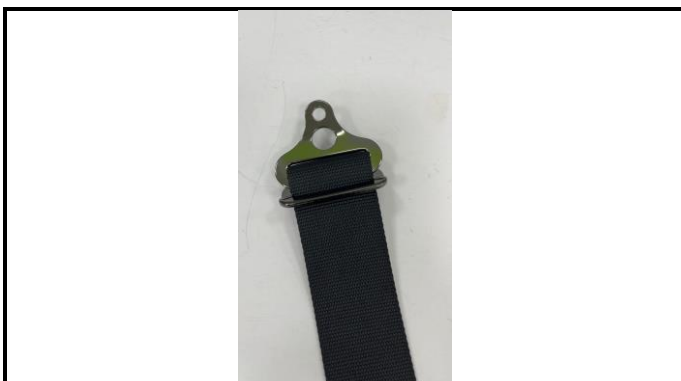
A1-1) Position / Position : Right Shoulder