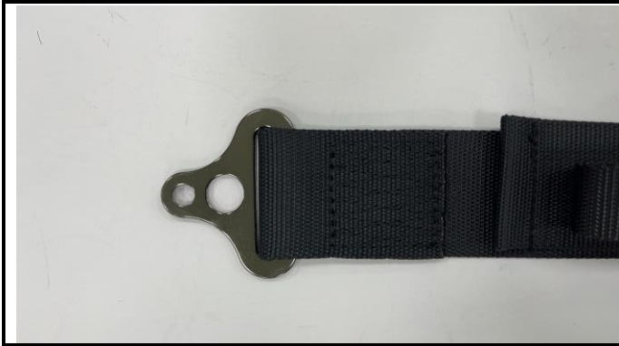
A1-3) Position / Position : Right Lap