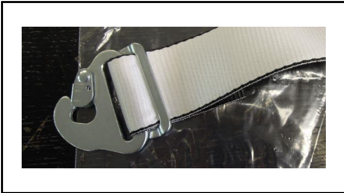
A1-5) Position / Position : Left Crotch strap