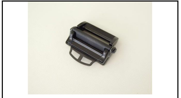
A2-2) Position / Position : Right Shoulder and Lap strap