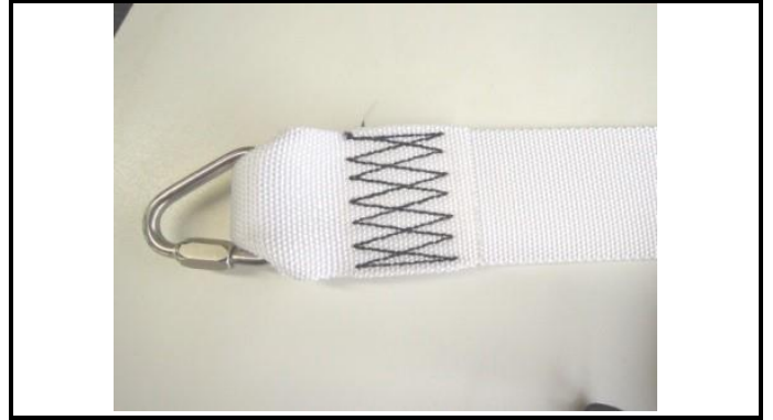
A1-4) Position / Position : Right Pelvic strap