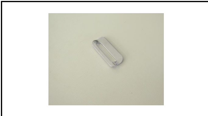
A2-3) Position / Position : Left Crotch strap