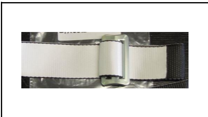
A1-1) Position / Position : Left Shoulder strap