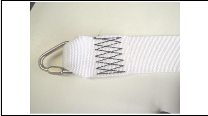
A1-3) Position / Position : Left Pelvic strap