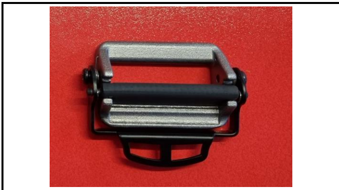
A2-1) Position / Position : Left Shoulder strap