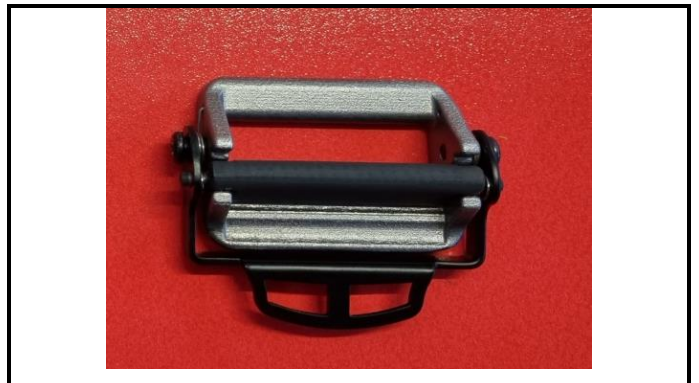
A2-2) Position / Position : Right Shoulder strap