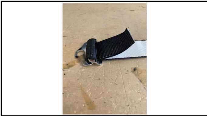
A1-5) Position / Position : Left Crotch strap