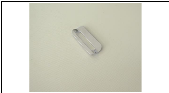
A2-3) Position / Position : Left Lap and Crotch strap