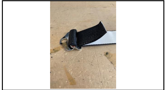
A1-4) Position / Position : Right Lap strap