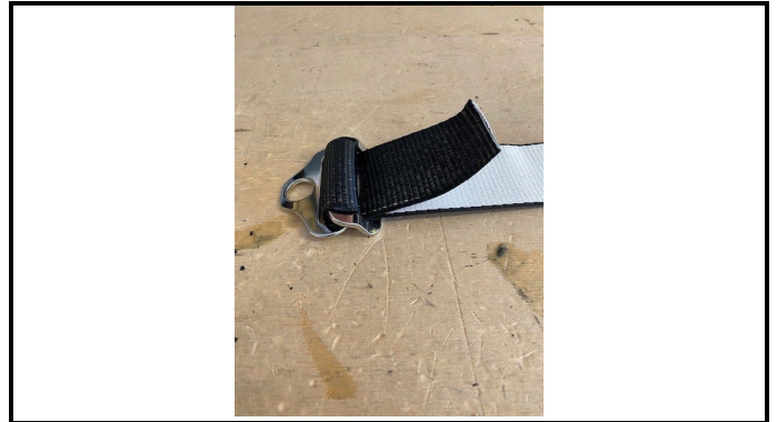
A1-4) Position / Position : Right Lap strap