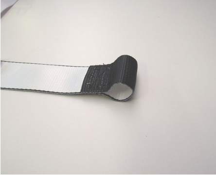
Alternative attachment on crotch strap