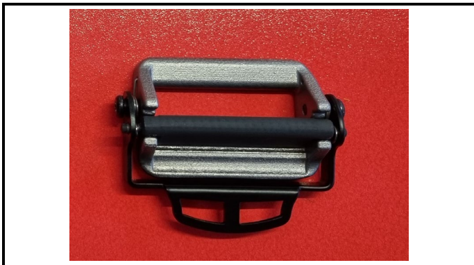
A2-1) Position / Position : Left Shoulder strap