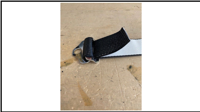
A1-5) Position / Position : Left Crotch strap