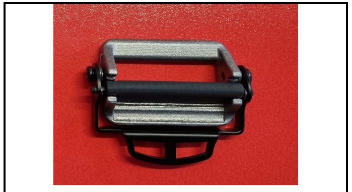
A2-2) Position / Position : Right Shoulder strap