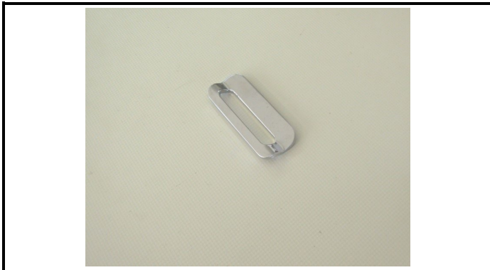
A2-3) Position / Position : Left Lap and Crotch strap