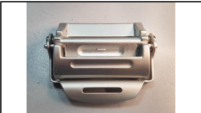
A2-1) Position / Position : Shoulder straps (left & right)