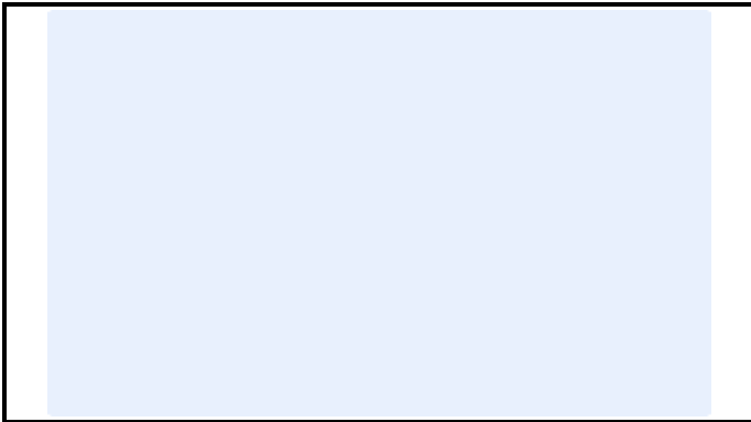
A1-5) Position / Position :