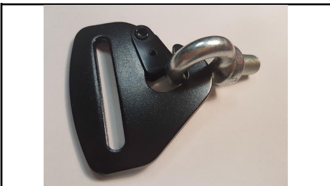
A1-1) Position / Position : Shoulder body straps (left & right)