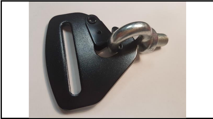
A1-3) Position / Position : Crotch straps (left & right)