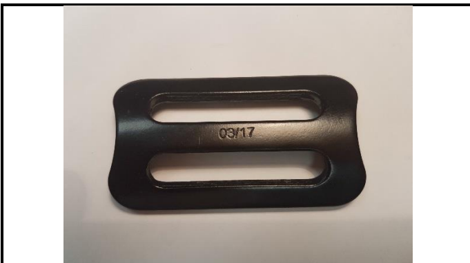
A2-3) Position / Position : Shoulder straps (left & right)