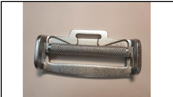
A2-1) Position / Position : Shoulder body straps (left & right)