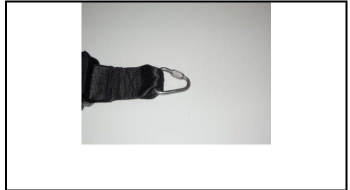
A1-4) Position / Position : Left lap strap