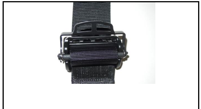
A2-2) Position / Position : Left shoulder and lap strap