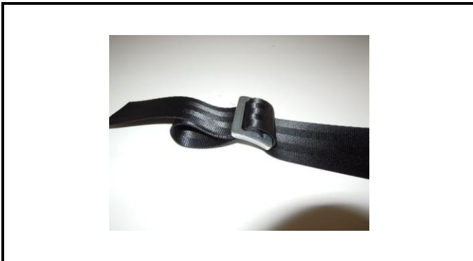
A2-3) Position / Position : Right shoulder and crotch strap