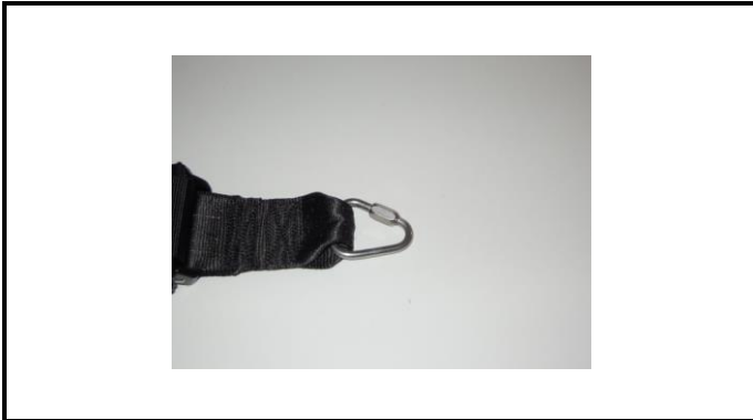
A1-3) Position / Position : Right lap strap