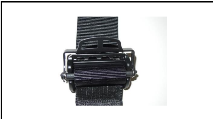
A2-1) Position / Position : Right shoulder and lap strap