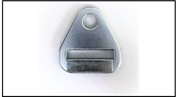
A1-4) Position / Position : Right Pelvic Strap Bolt-In