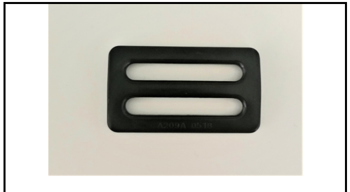
A2-2) Position / Position : Left & Right Shoulder Body Top Straps