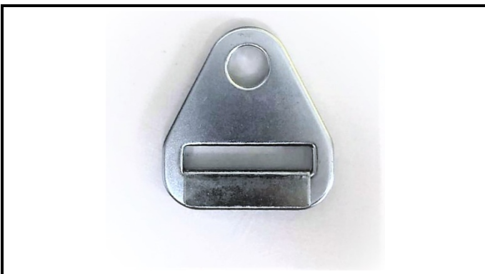
A1-1) Position / Position : Left Shoulder Body Strap Bolt-In