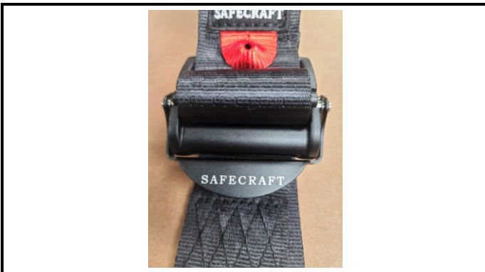
A2-1) Position / Position : Left & Right Shoulder Body Straps