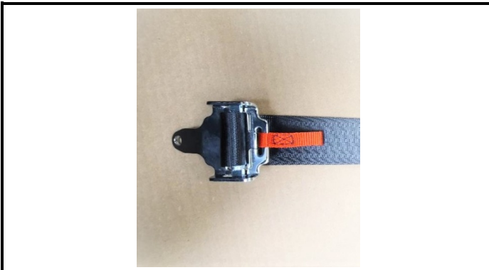
A2-3) Position / Position : Left & Right Pelvic Straps