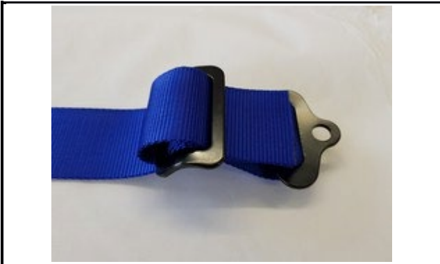
A1-5) Position / Position : LEFT CRUTCH STRAP