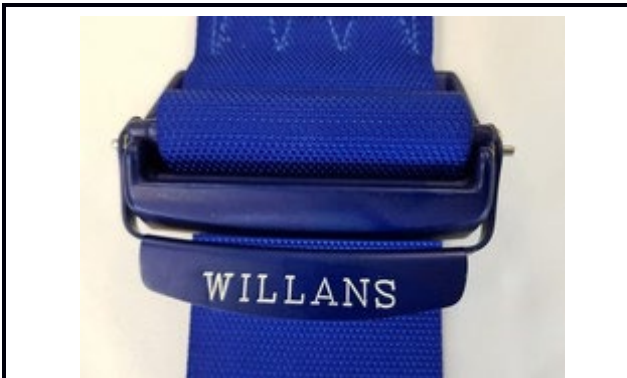
A2-3) Position / Position : LEFT LAP STRAP