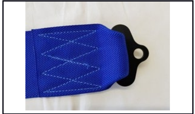
A1-4) Position / Position : RIGHT LAP STRAP