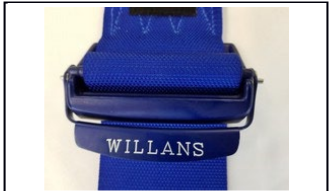
A2-2) Position / Position : RIGHT SHOULDER