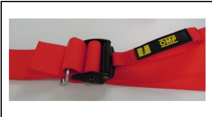
A2-3) Position / Position : Right lap strap