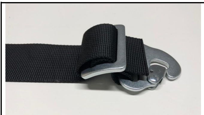
A1-1) Position / Position : Right Shoulder strap