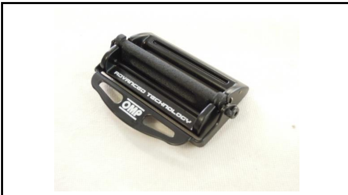
A2-1) Position / Position : Right shoulder and lap strap