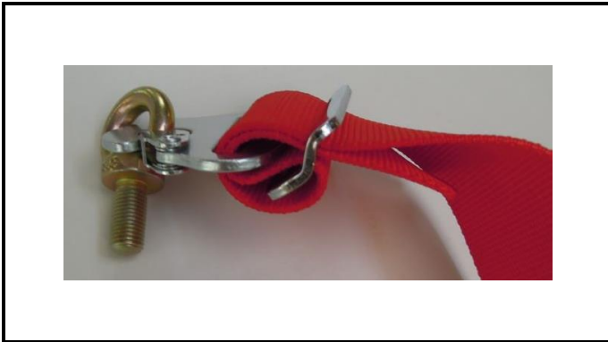
A1-5) Position / Position : Right Crotch strap