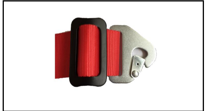
A1-4) Position / Position : Left Pelvic Lap Strap