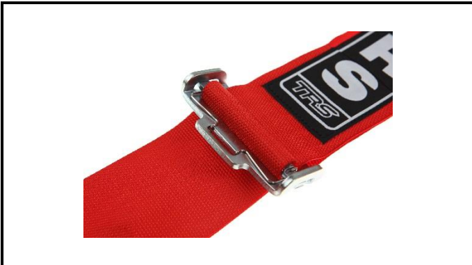
A2-1) Position / Position : Right Shoulder Adjuster