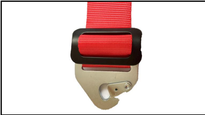
A1-5) Position / Position : Right Crutch Strap