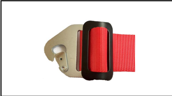
A1-3) Position / Position : Right Pelvic Lap Strap