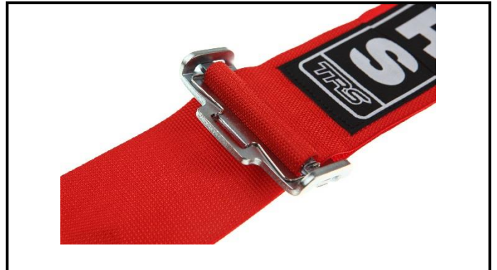
A2-2) Position / Position : Left Shoulder Adjuster