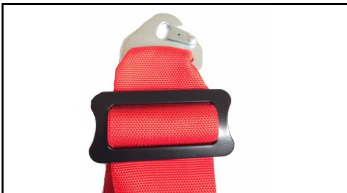
A1-1) Position / Position : Right Shoulder Strap