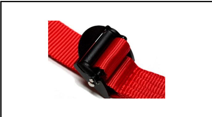
A2-3) Position / Position : Right Pelvic Lap Adjuster