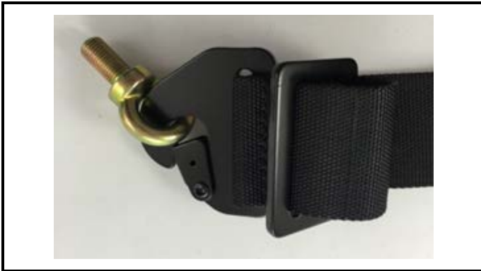
A1-5)Position / Position : Right Crotch