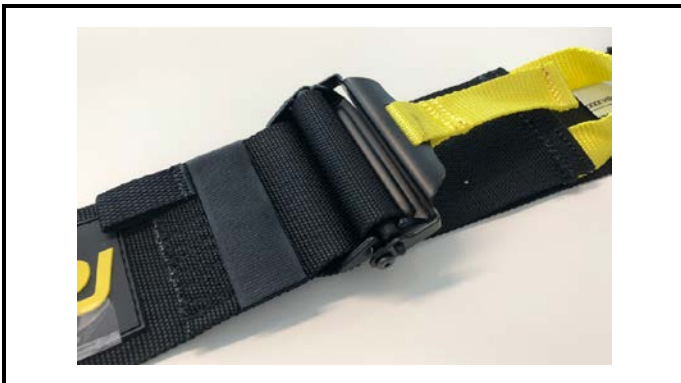
A2-1) Position / Position : Left and right shoulder