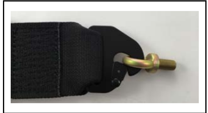
A1-4)Position / Position : Left Lap