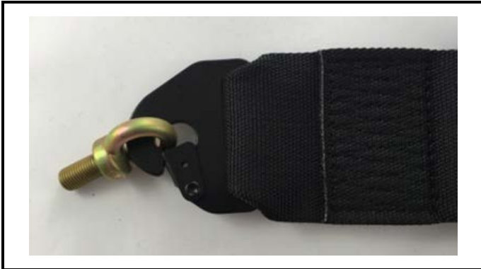
A1-3)Position / Position : Right Lap