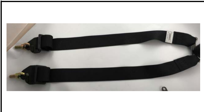
A2-3) Position / Position : Left and right crotch