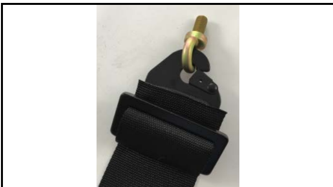
A1-1) Position/ Position :