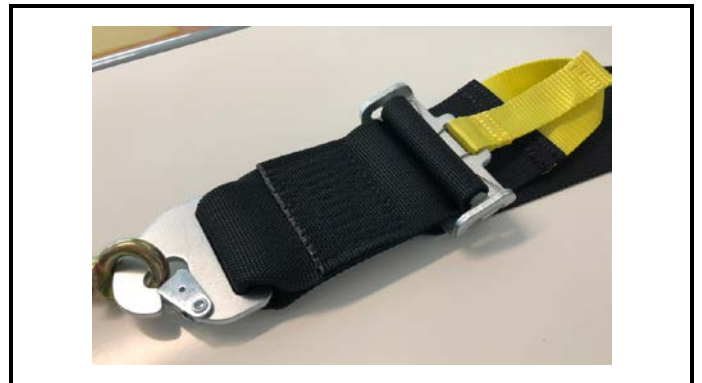
A2-2) Position / Position : Left and right Lap (pull-up)