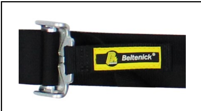
A2-3) Position / Position : Right Lap