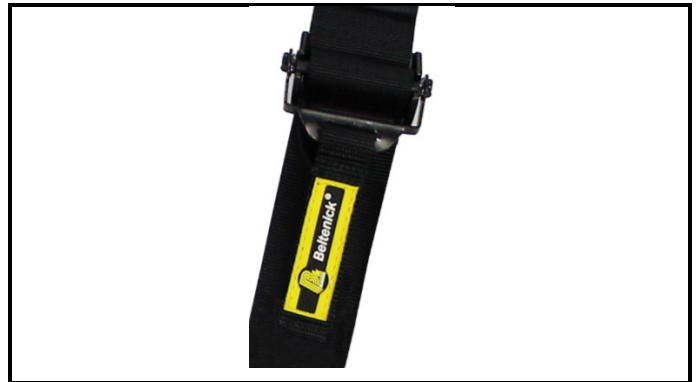
A2-2) Position / Position : Left Shoulder