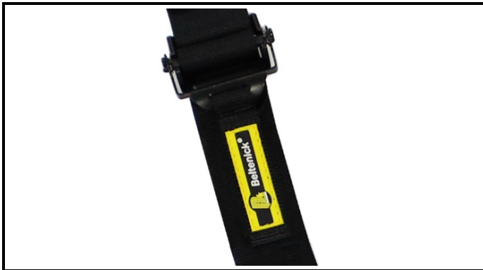
A2-1) Position / Position : Right Shoulder