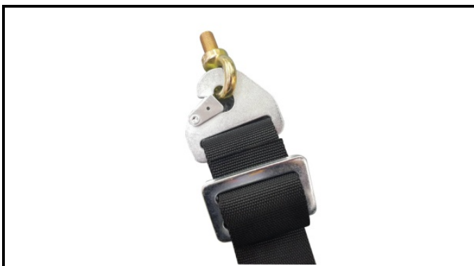
A1-1) Position / Position : Right Shoulder