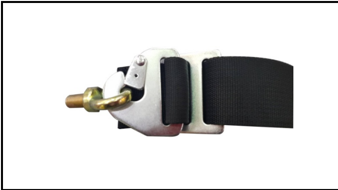
A1-5) Position / Position : Right Crotch