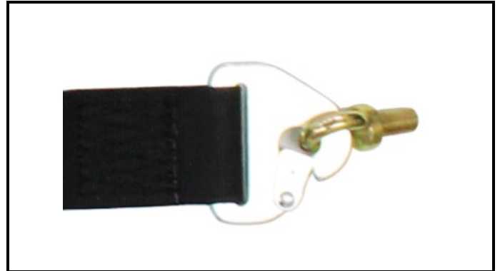
A1-4) Position / Position : Left Lap