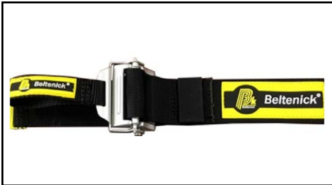
A2-1) Position / Position : Right Shoulder