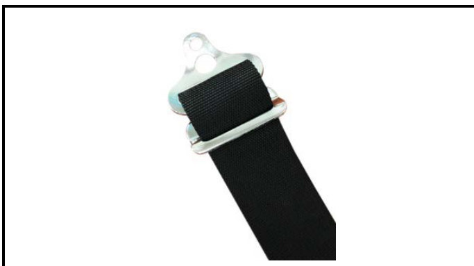
A1-1) Position / Position : Right Shoulder