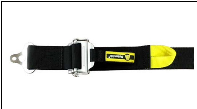
A2-3) Position / Position : Right Lap