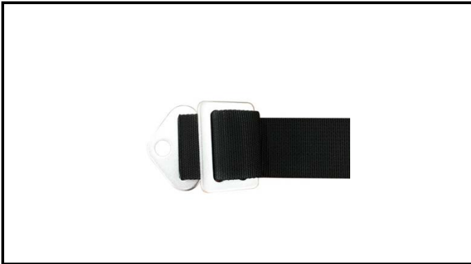
A1-5) Position / Position : Right Crotch