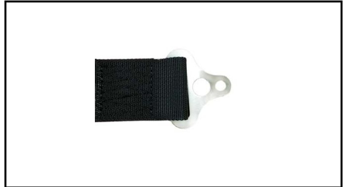
A1-4) Position / Position : Left Lap