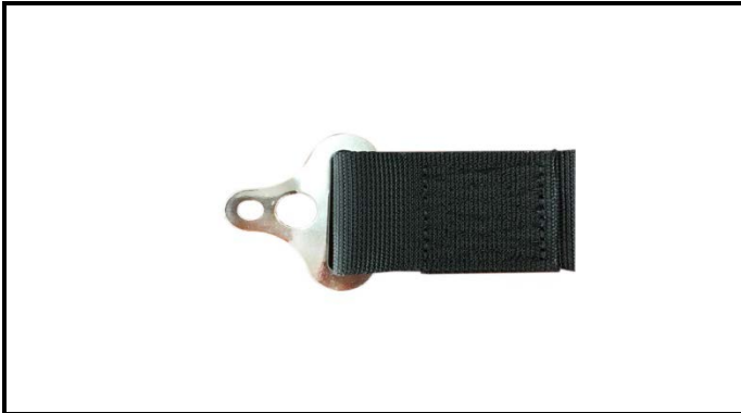
A1-3) Position / Position : Right Lap