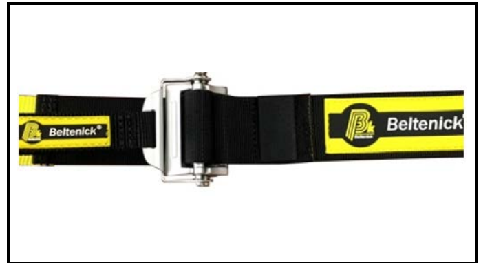
A2-2) Position / Position : Left Shoulder