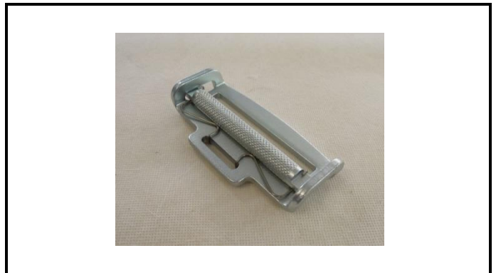
A2-2) Position / Position : Left Shoulder and lap strap