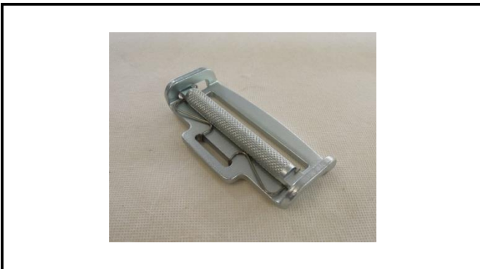
A2-1) Position / Position : Right shoulder and lap strap