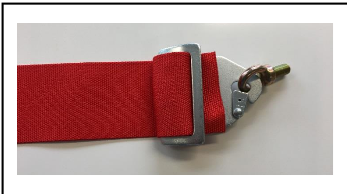
A1-1) Position / Position : Right Shoulder strap