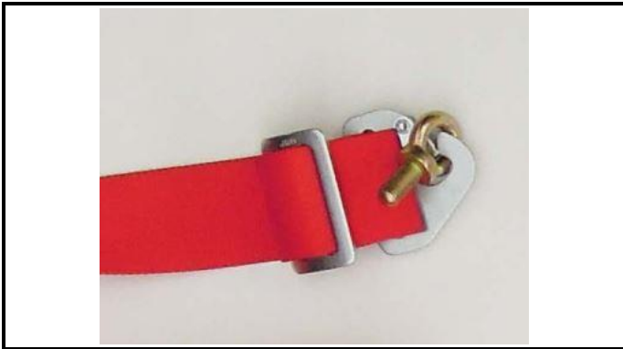
A1-5) Position / Position : Right Crotch strap