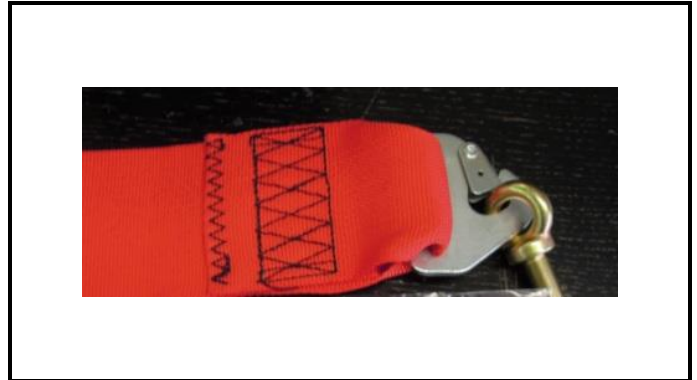
A1-4) Position / Position : Left Pelvic strap