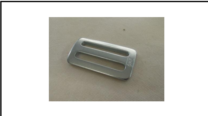
A2-3) Position / Position : Right crotch strap