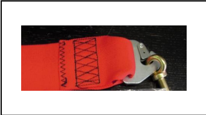
A1-3) Position / Position : Right Pelvic strap