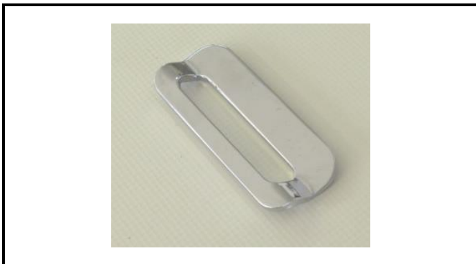
A2-3) Position / Position : Right crotch strap