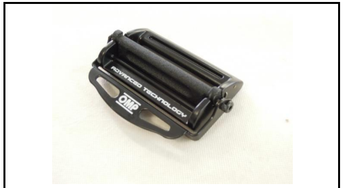
A2-2) Position / Position : Left Shoulder and lap strap