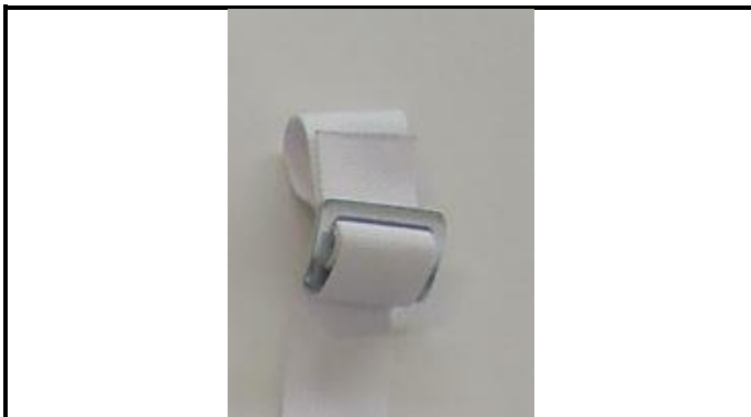
A1-1) Position / Position : Right Shoulder strap