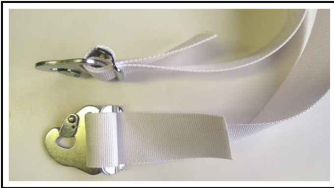
A1-5) Position / Position : Right Crotch strap