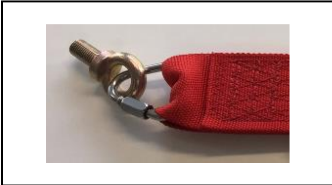
A1-3) Position / Position : Right Pelvic strap