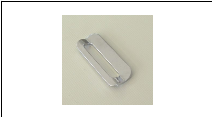
A2-3) Position / Position : Right crotch strap