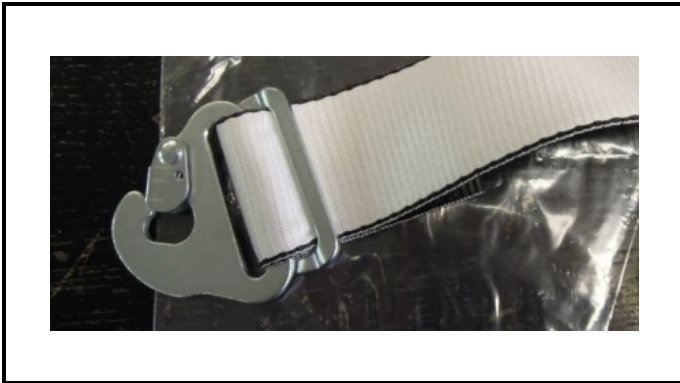
A1-5) Position / Position : Right Crotch strap