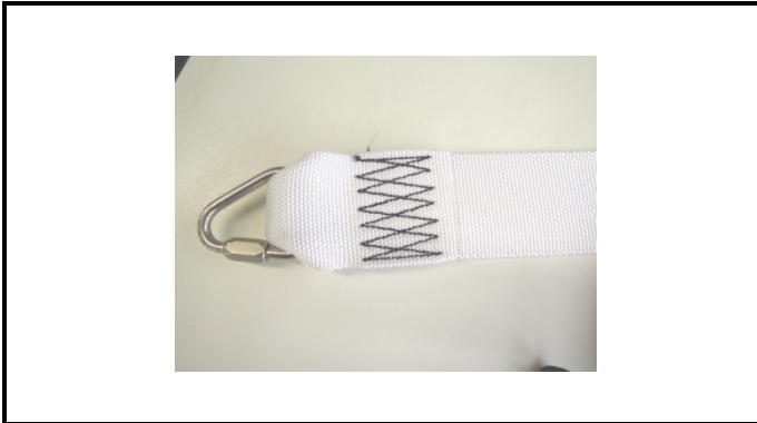
A1-3) Position / Position : Right Pelvic strap