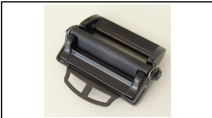
A2-1) Position / Position : Right shoulder and lap strap