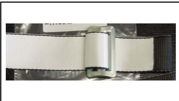
A1-1) Position / Position : Right Shoulder strap