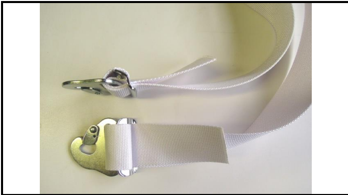
A1-5) Position / Position : Right Crotch strap