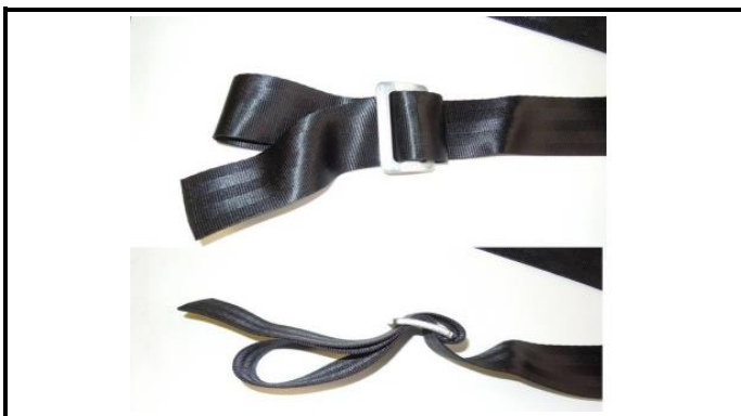
A1-1) Position / Position : Right Shoulder strap