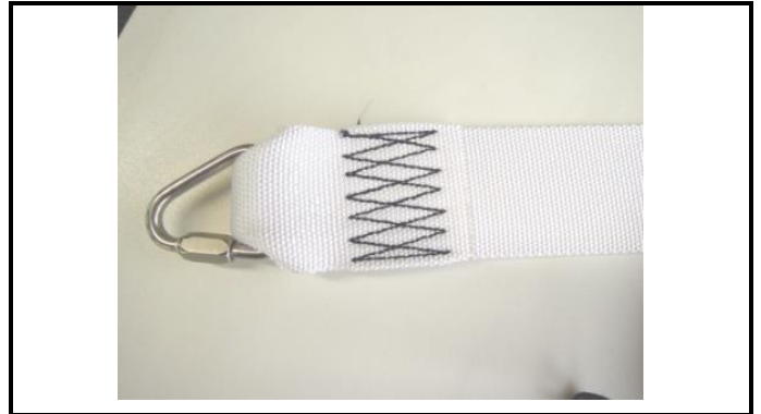
A1-4) Position / Position : Left Pelvic strap