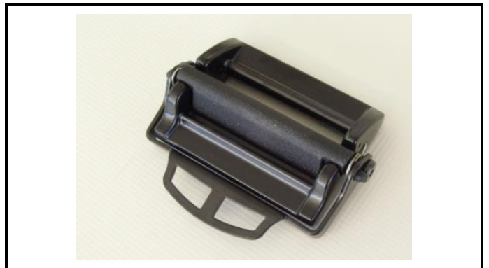
A2-2) Position / Position : Left Shoulder and lap strap