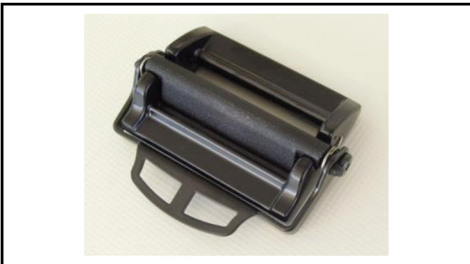
A2-1) Position / Position : Right shoulder and lap strap