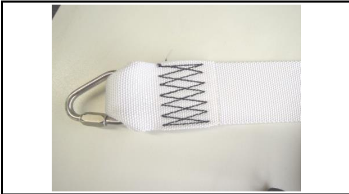
A1-3) Position / Position : Right Pelvic strap