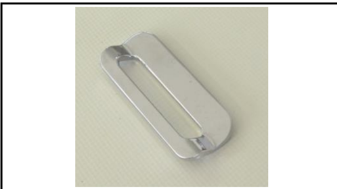
A2-3) Position / Position : Right crotch strap