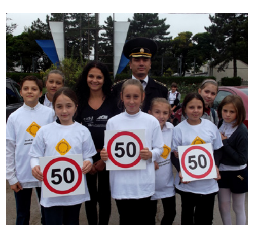
Moldovan children present their 'Speed Limit 50' signs as part of the ACM's safety campaign.