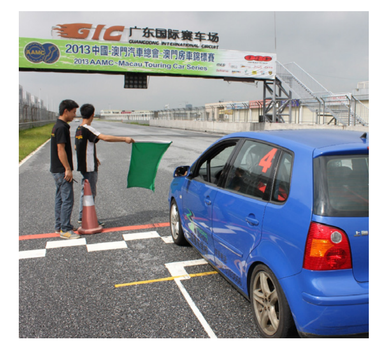
The HKAA's Young Driver Safety programme now includes motor sport safety advice.