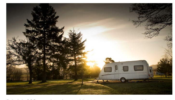
Britain's CCC says there is no evidence to suggest roadworthiness testing of caravans will make roads safer.