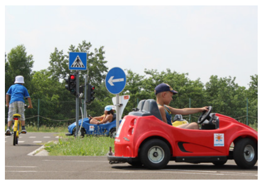
MNASZ's Driving Centre is this year focusing on teaching youngsters safe road use.