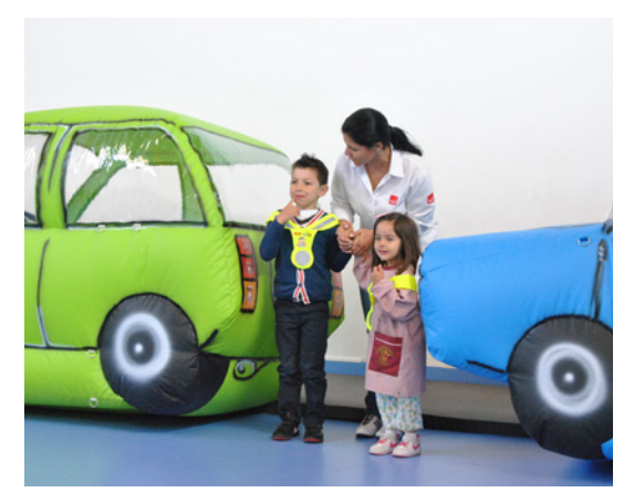
A scene from the ACP's child-focused safe road use TV campaign 'One Safety Minute Kids'.