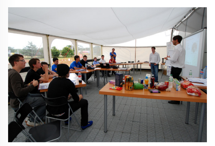
Aspiring racing drivers are given Anti-Doping advice at one of the MSA's Performance Master Classes.