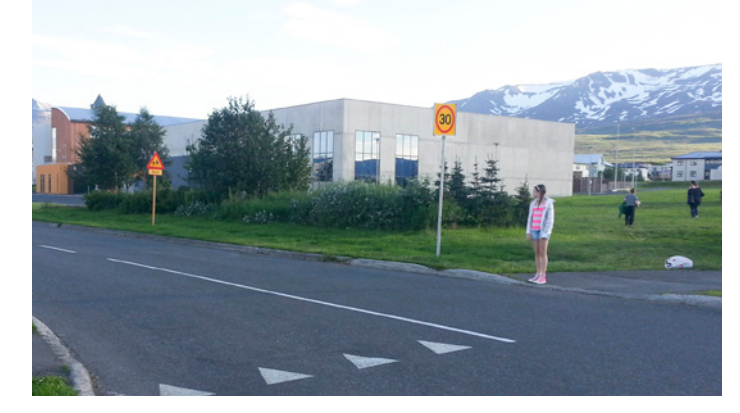
Iceland's FÍB is calling for clearer marking on pedestrian crossings in a bid to protect children walking to and from school.