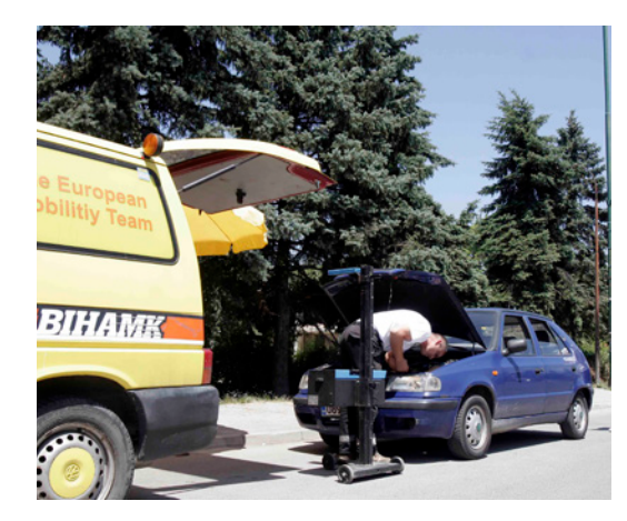
BIHAMK found that just 55% of vehicles tested during its Travel Safety programme met acceptable standards