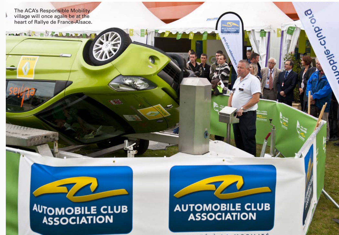
The ACA's Responsible Mobility village will once again be at the heart of Rallye de France-Alsace.