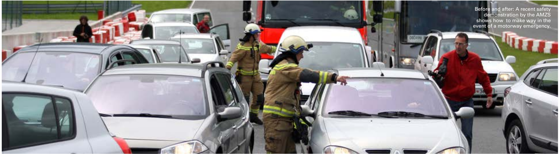
Before and after: A recent safety demonstration by the AMZS shows how to make way in the event of a motorway emergency.