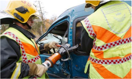
A vehicle rescue sheet can aid emergency crews in crash extractions.