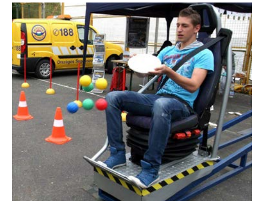
MAK's road safety programme aimed at university towns has been a success in recent months.