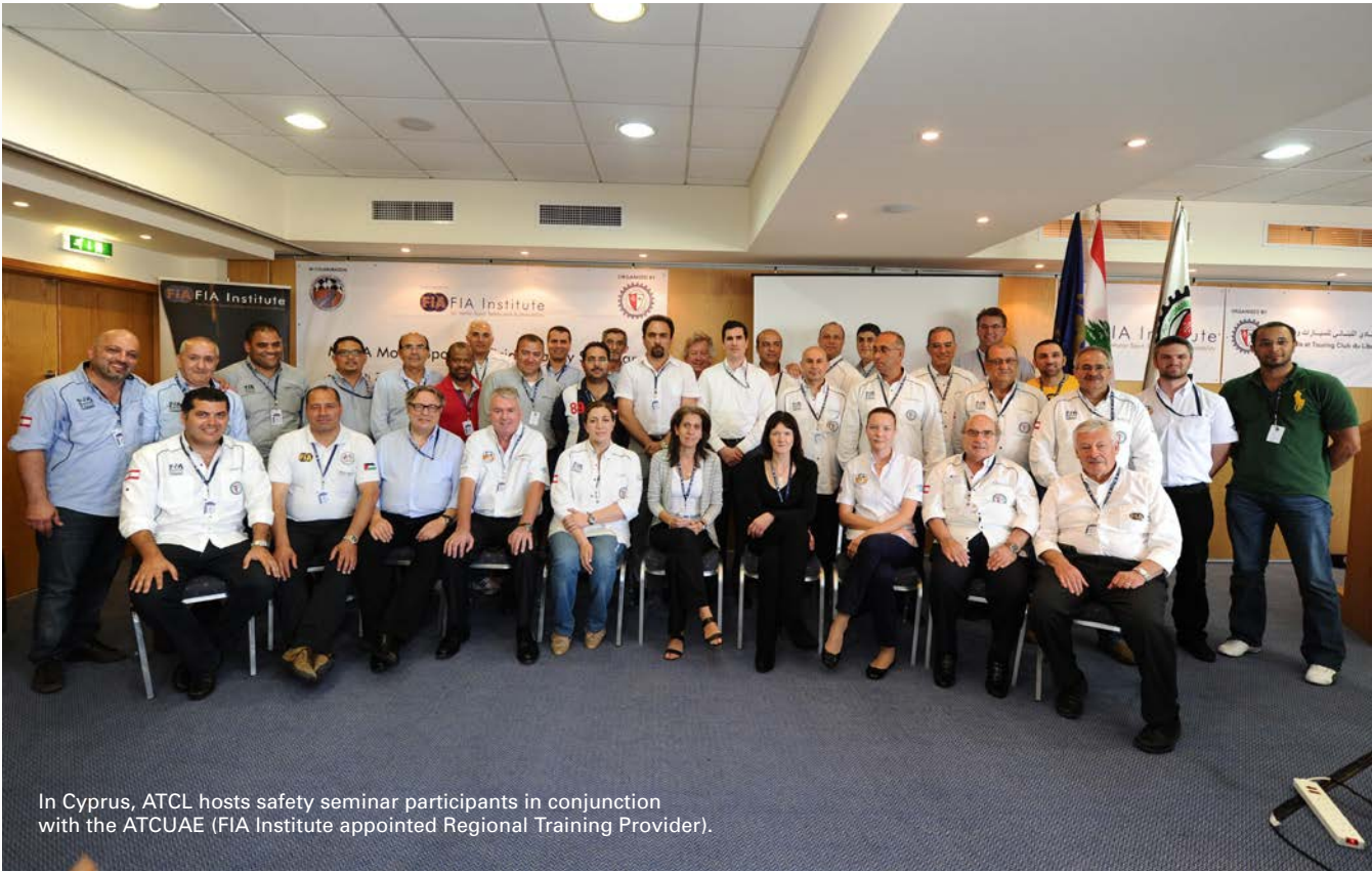
In Cyprus, ATCL hosts safety seminar participants in conjunction with the ATCUAE (FIA Institute appointed Regional Training Provider).