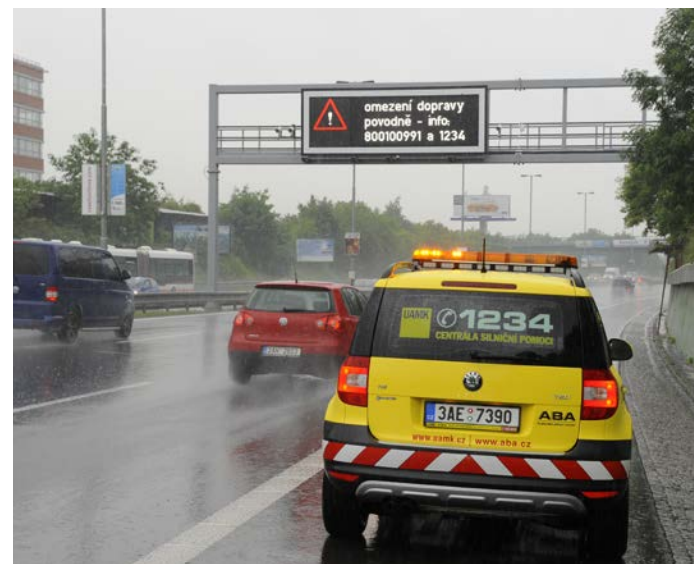
UAMK vehicles, as well as those of partner organisations, were made available to aid people affected by June's flooding in central Europe.