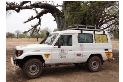
A FISA First Intervention Vehicle at the 2013 edition of the Rallye Bandama Côte d'Ivoire.

Fédération Ivoirienne de Sport Automobile