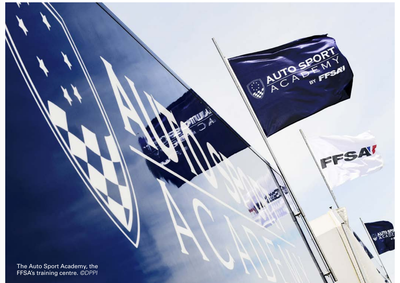
The Auto Sport Academy, the FFSA's training centre.