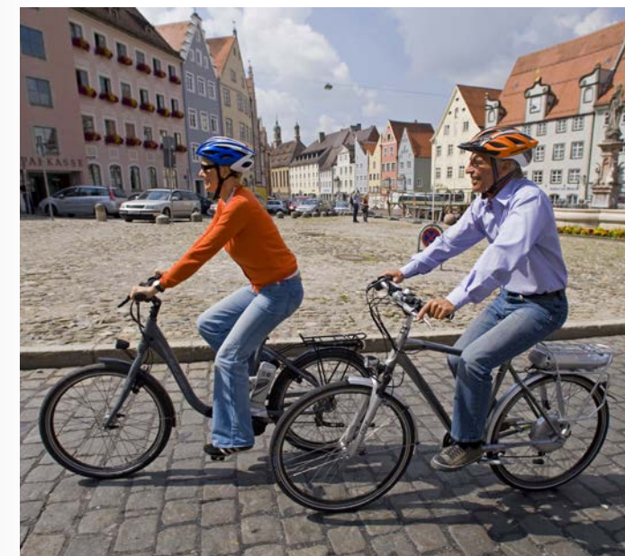
ADAC found that 54% of all severe bicycling accidents affect the head.