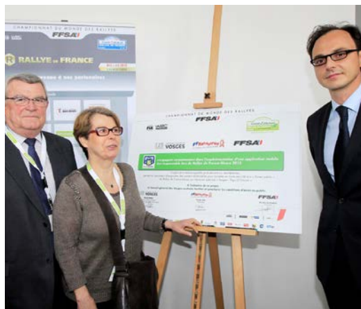
The RandoMobile app launch by the Vosges General Council, the French Hiking Federation and the FFSA.