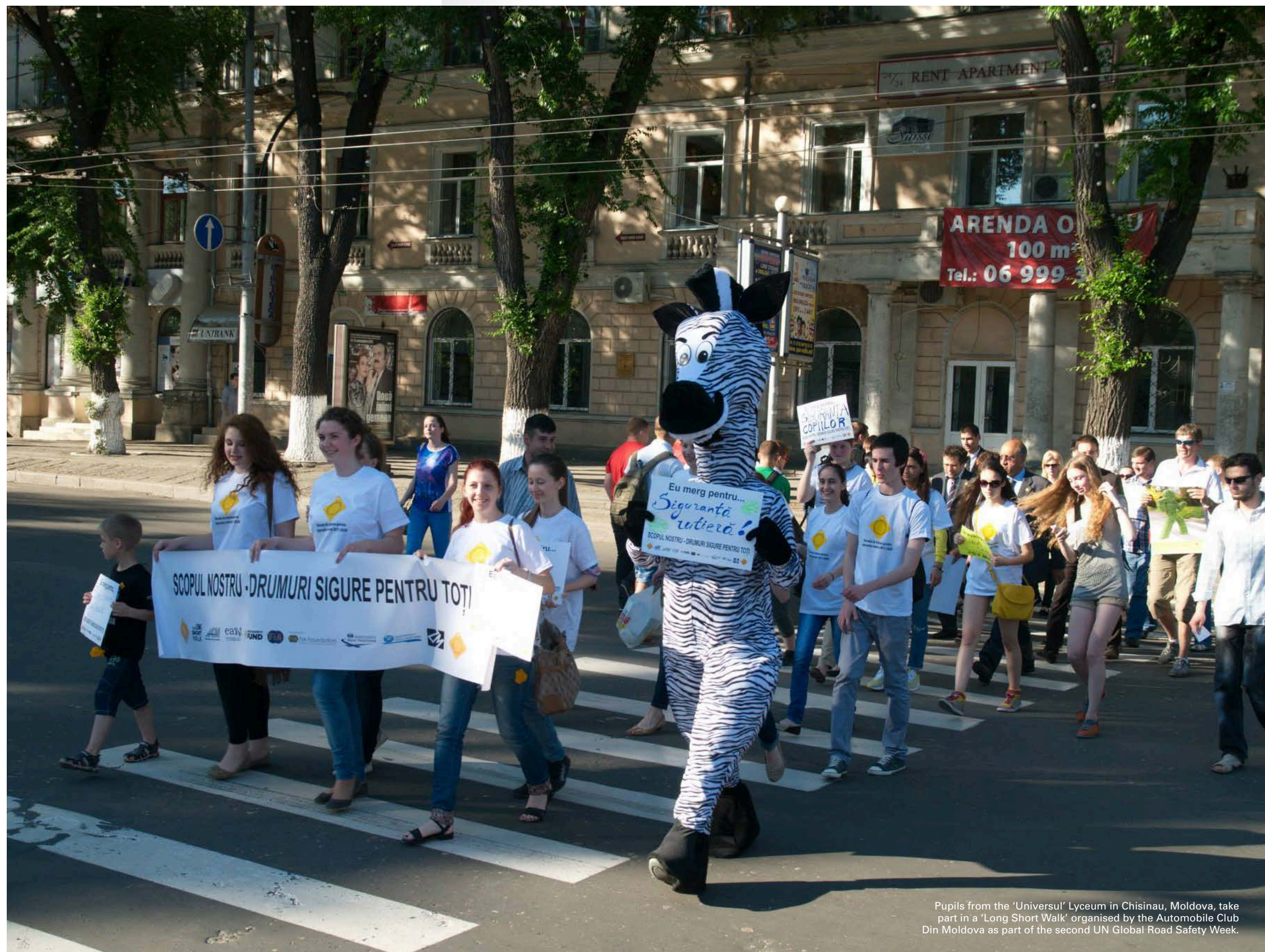
Pupils from the 'Universul' Lyceum in Chisinau, Moldova, take part in a 'Long Short Walk' organised by the Automobile Club Din Moldova as part of the second UN Global Road Safety Week.

For more information see: saferoads.md/index .