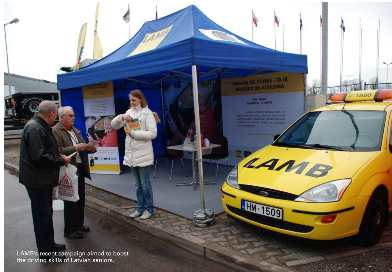
LAMB's recent campaign aimed to boost the driving skills of Latvian seniors.

Allgemeiner Deutscher Automobil-Club e.V.