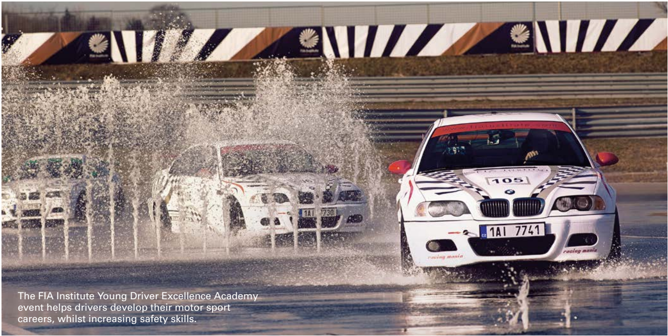
The FIA Institute Young Driver Excellence Academy event helps drivers develop their motor sport careers, whilst increasing safety skills.