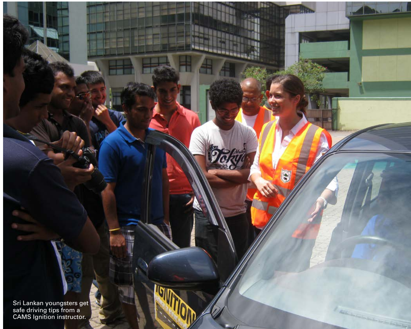
Sri Lankan youngsters get safe driving tips from a CAMPS Ignition instructor.