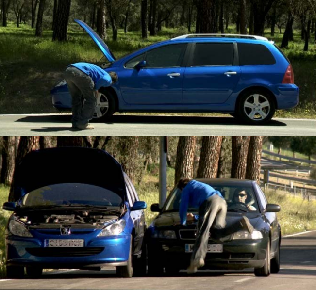
RACE found that accidents involving pedestrians are seven times as deadly as those involving car passengers.

According to a data collected from more than 400,000 roadside assistance cases attended to by RACE operations