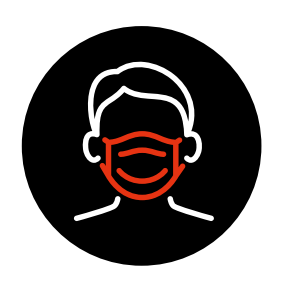
Wearing a mask mandatory