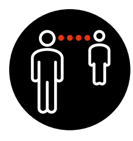
Keep your distance