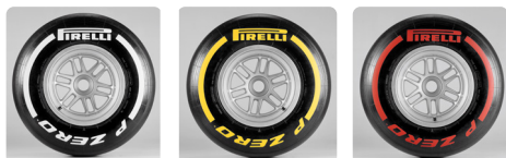
C2 - HARD