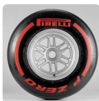
C4 - SOFT