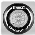
C2 - HARD