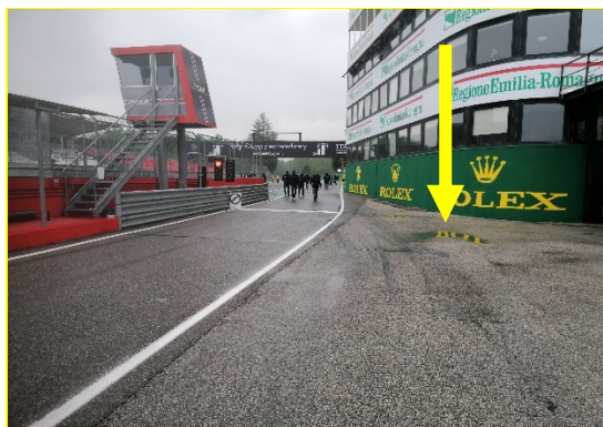
Figure 1 Practice Starts