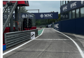
Pit Lane Ends