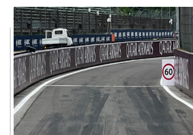
Pit Lane Starts