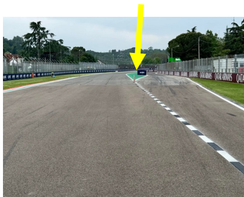
Figure 3 Bollard at Pit Entry