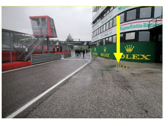
Figure 1 Practice Starts

16.2. For the time the pit exit is open for the race, practice starts may be carried out after the pit exit where a box is painted.