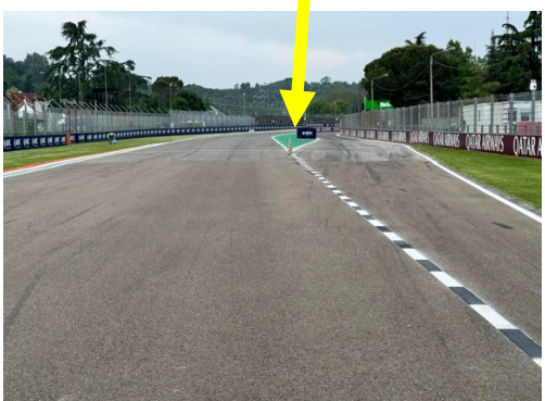
Figure 3 Bollard at Pit Entry