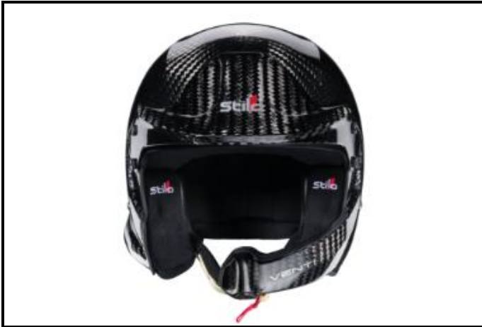
D1) Vue de face / Front view