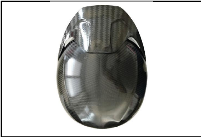
D3) Vue de haut / Top view