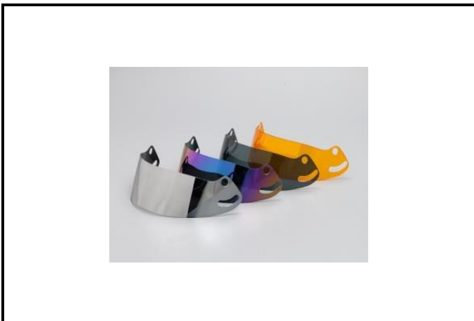
E5) Visor Sunshield (short)