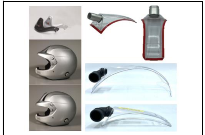
E4) Adjustable Peak