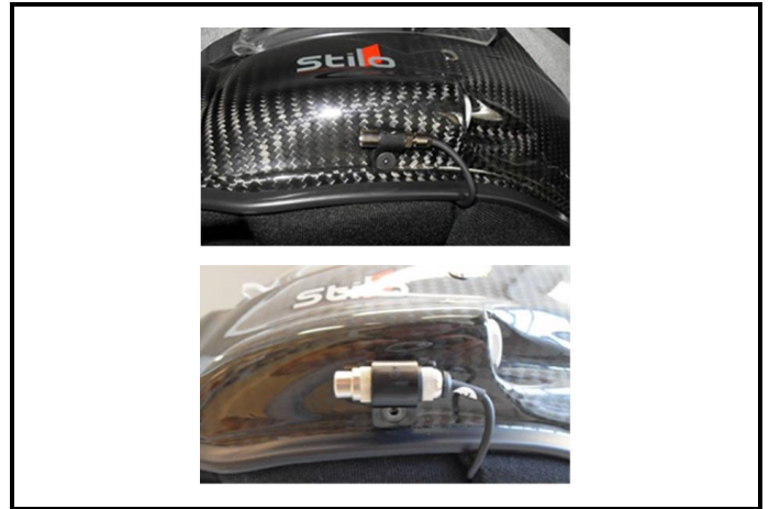
E2) Clip earplugs connector