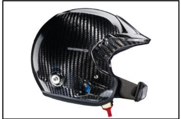
D2) Vue du Côté Droite / Right Side view