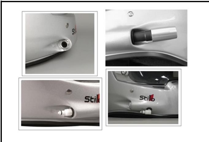
E3) Side port components