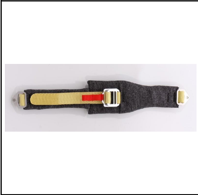
E17) ALTERNATIVE CHIN STRAP V23