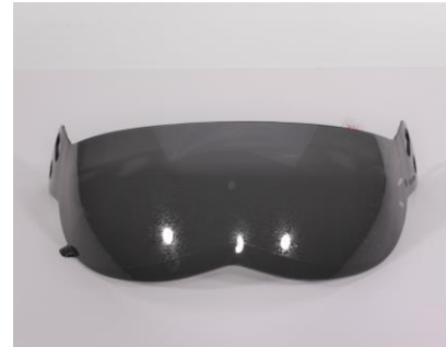
E4) [H2REN] Adjustable sunscreen M10L 1.7mm