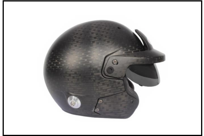
D2) Vue du Côté Droite / Right Side view