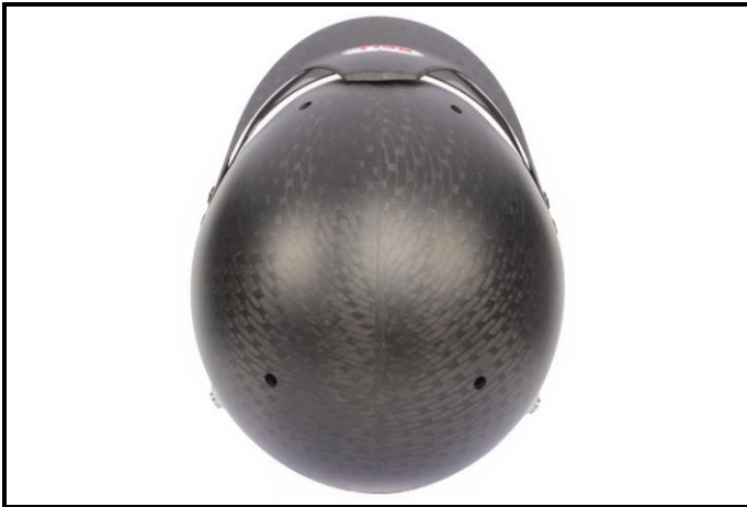
D3) Vue de haut / Top view