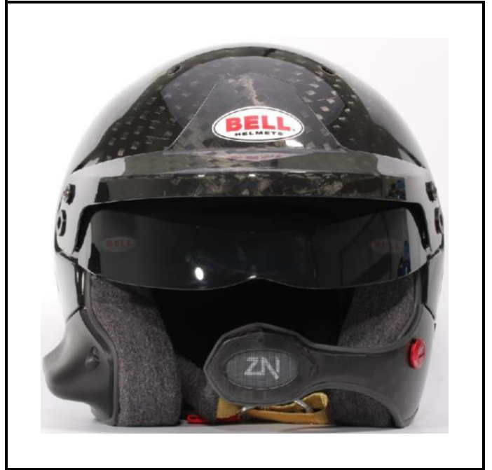
E18) Half Chin Bar-Short