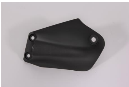
E5) [H3WJA] Side cover-female connector HP10&MAG-10