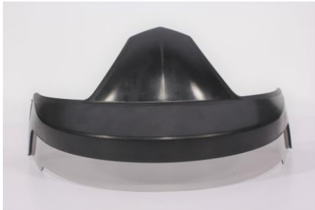
E3) [H3NZN] Injection - peak HP10&MAG-10