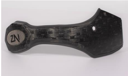
E1) [MPTRX] Half chin bar carbon-HP10&MAG-10 carbon