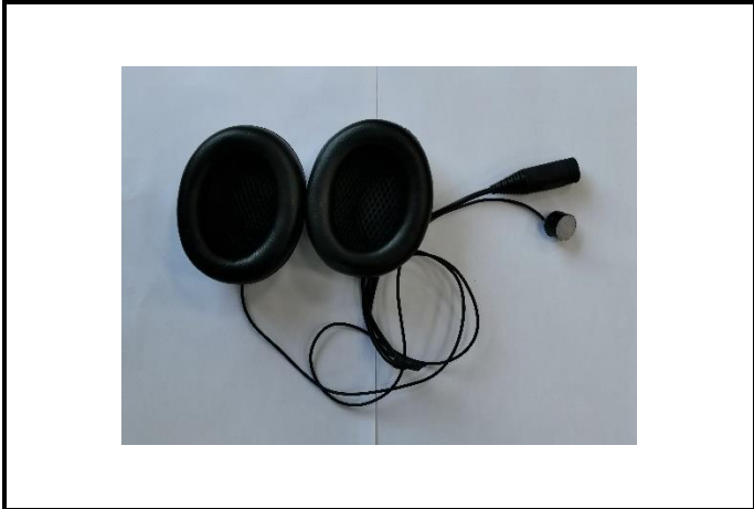
E7) Helmet Radio kit PRO