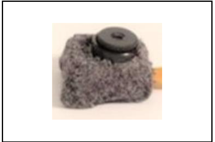
E10) In-helmet camera driver's Gen.2 - Narrow