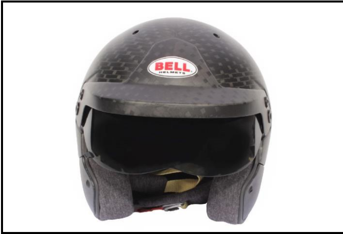
D1) Vue de face / Front view