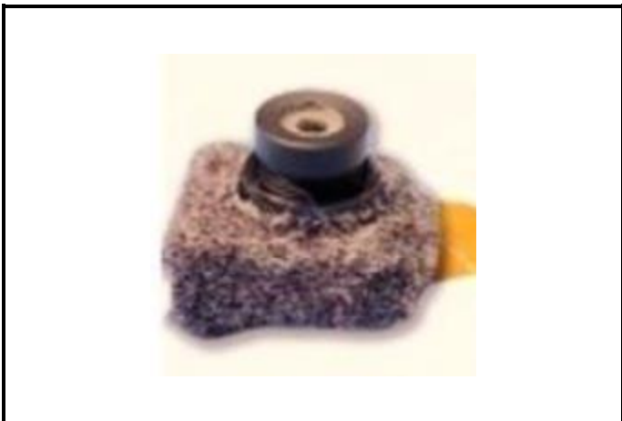
E11) In-helmet camera driver's Gen.2 - Wide