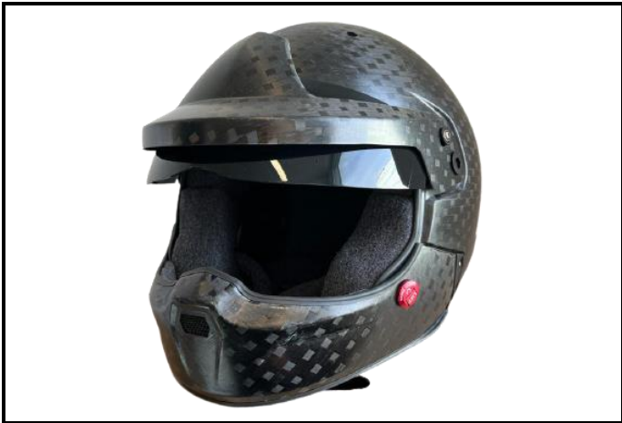
E9) Full Chin Bar (with tool-less screw)