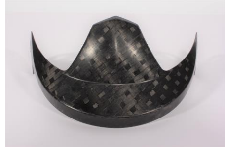
E2) [MPFEC] Peak - HP10&MAG-10 carbon