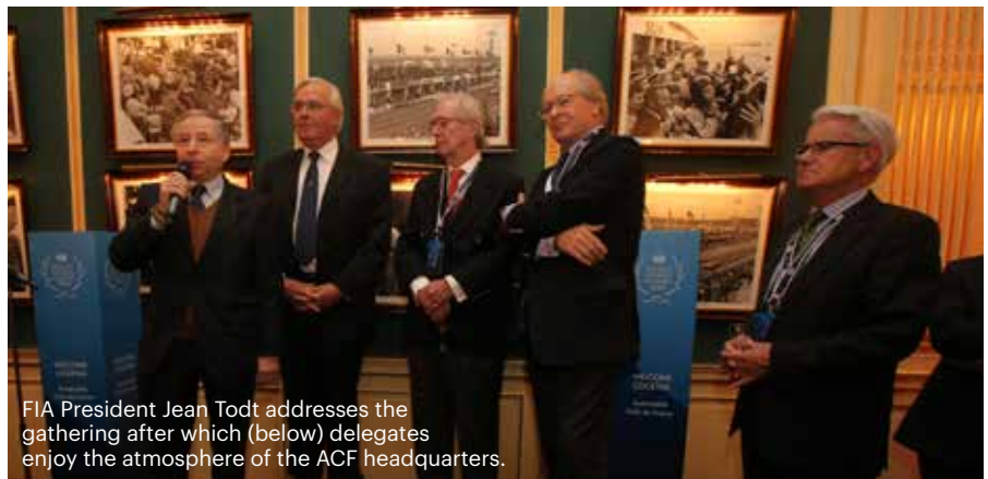
FIA President Jean Todt addresses the gathering after which (below) delegates enjoy the atmosphere of the ACF headquarters.

"This week also represents a yearly opportunity to make an assessment of our organisation – how we improved, where we failed to improve, where we need to improve and I'm very thankful that you are all here to participate in this important week."