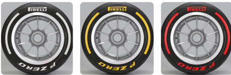
C2 - HARD