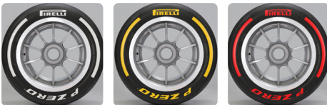
C1 - HARD