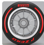
C5 - SOFT