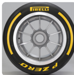
C4 - MEDIUM