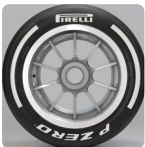
C3 - HARD