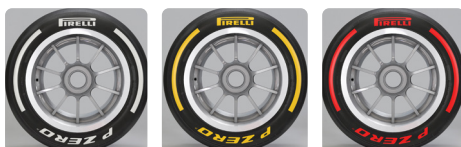
C2 - HARD