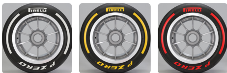
C1 - HARD C2 - MEDIUM C3 - SOFT