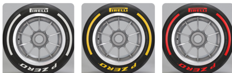
C3 - HARD