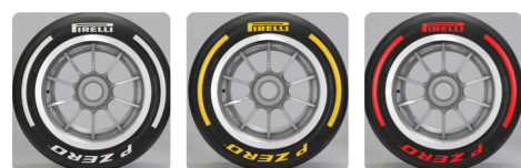
C3 - HARD C4 - MEDIUM C5 - SOFT