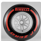
C4 - SOFT