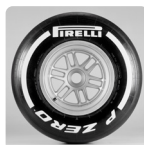
C2 - HARD