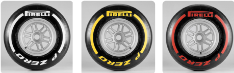
C2 - HARD