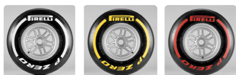
C2 - HARD C3 - MEDIUM C4 - SOFT