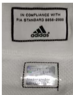
(year of manufacturer missing)

However, due to a production error, the ADIDAS products listed in Table 1 were produced with the following incorrect labelling in Figure 2: