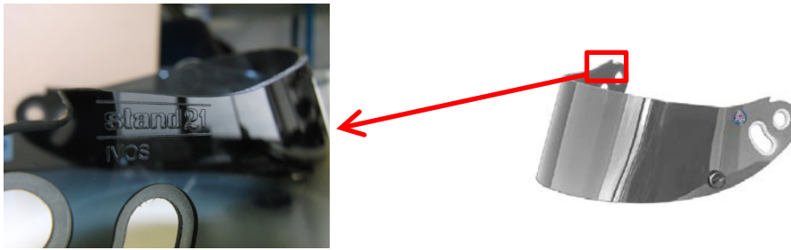
Figure 3 – Manufacturer and model engraved on visor

In order to check the manufacturing date of the helmets visors in accordance with standards 8858, 8859 and 8860, you can check the information engraved on the side of the visor as shown in the examples in Figures 4 and 5.