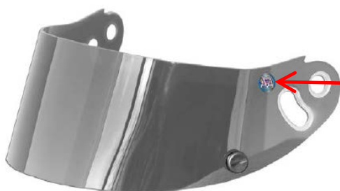
Figure 1 – Position of the sticker on outside the visor

The FIA sticker is a holographic, 10mm diameter silver logo with two letters as Figure 2 and must be glued on the outside of the visor as indicated in Figure 1.