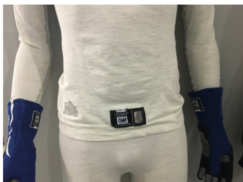
Figure 4 – Example positioning of the homologation label and FIA hologram on underwear top.

Underwear, top and bottom: the homologation label and FIA hologram must be affixed on the exterior of the garment at waist level at the front or rear as shown in the examples in Figures 4 and 5.