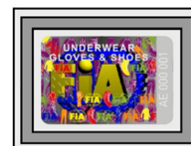
Figure 2 – FIA hologram

Please note also that products manufactured before 1 January 2016 use the former labelling system without the FIA hologram and they are still valid . The former FIA label must comply with the template in Figure 3 and it does not include the manufacturing year.