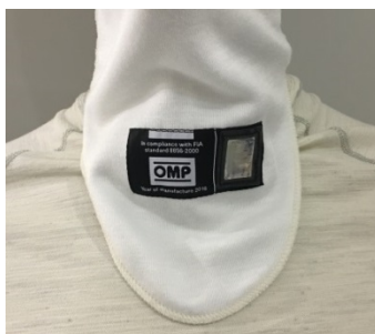
Figure 6 – Example positioning of the homologation label and FIA hologram on a balaclava.

Balaclavas: the homologation label and FIA hologram must be situated on the exterior of the balaclava, in the lower-front section as shown in the example in Figure 6.