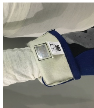
Figure 8 – Example positioning of the homologation label and FIA hologram on gloves.

We will inform you in due time if we decide to fix a deadline for the validity of the old labelling system.