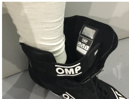
Figure 7 – Example positioning of the homologation label and FIA hologram on shoes.

Gloves: the homologation label must be affixed to the exterior cuff of each glove, and the FIA hologram must be affixed to the inside of the cuff, positioned exactly beneath the homologation label, as shown in Figure 8.