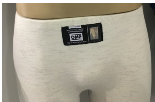
Figure 5 – Example positioning of the homologation label and FIA hologram on underwear bottoms.

Balaclavas: the homologation label and FIA hologram must be situated on the exterior of the balaclava, in the lower-front section as shown in the example in Figure 6.