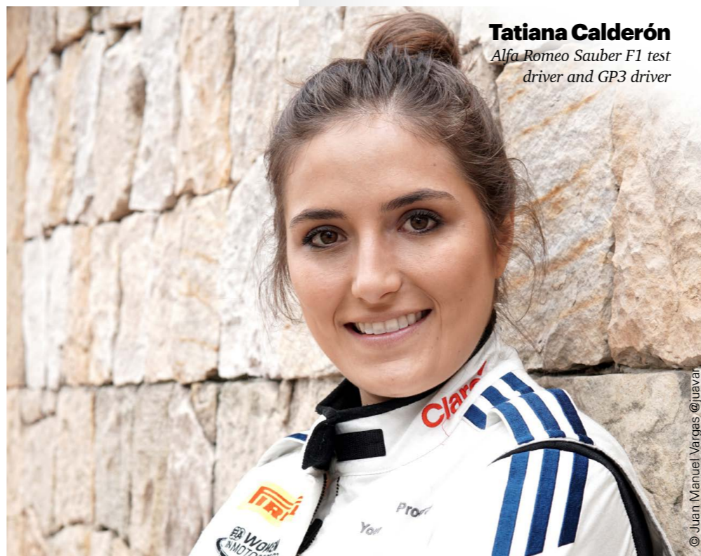
Tatiana Calderón Alfa Romeo Sauber F1 test driver and GP3 driver