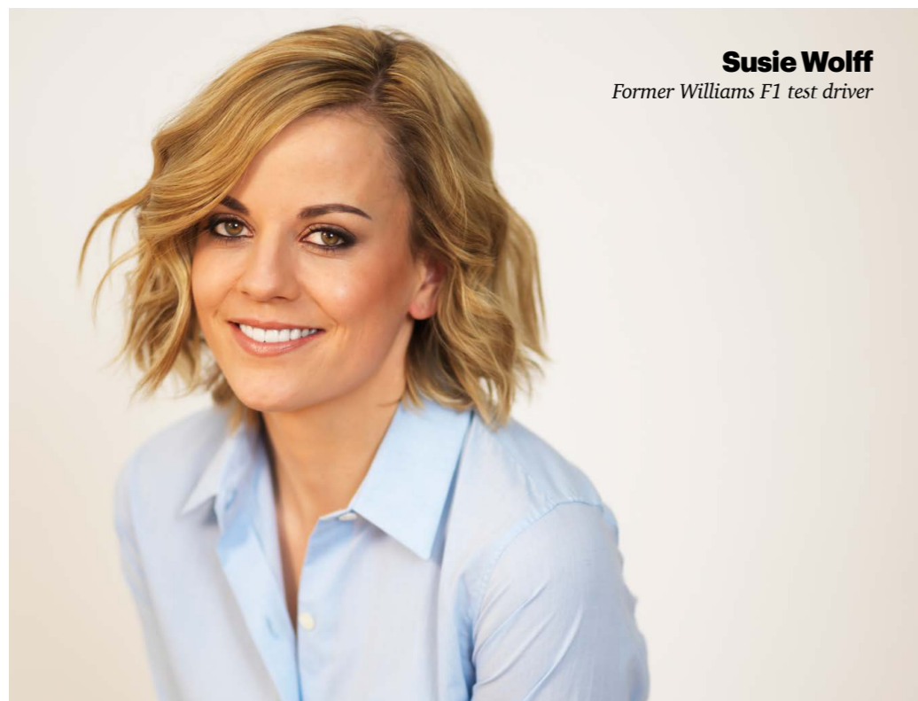
Susie Wolff Former Williams F1 test driver