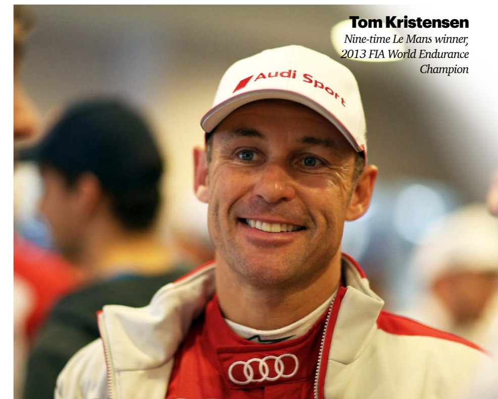
Tom Kristensen Nine-time Le Mans winner, 2013 FIA World Endurance Champion