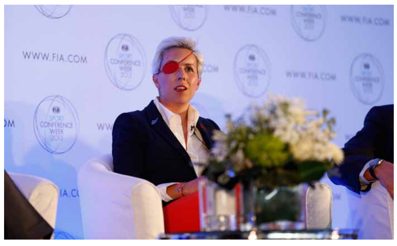
Women in Motorsport Commission ambassador Maria de Villota speaking at the inaugural FIA Sport Conference Week in June.