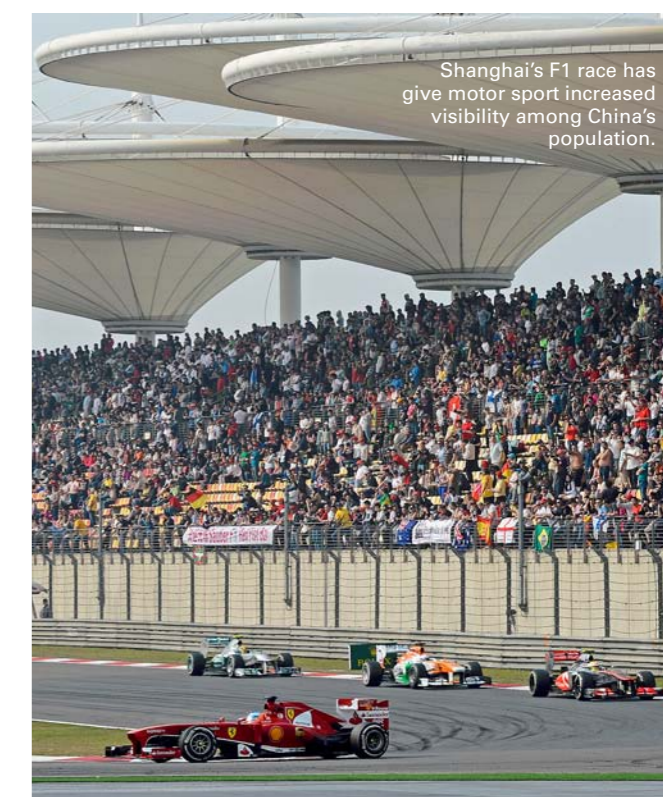
Shanghai's F1 race has give motor sport increased visibility among China's population.