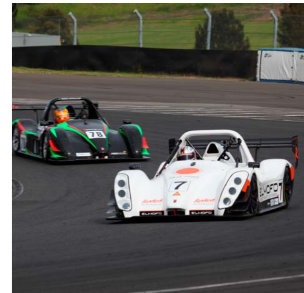
The fight of the future: electric versus fossil fuel-derived power.

It remains to be seen where team ELMOFO can take the new technology in 2014 but it would appear to be something of a sign of things to come.