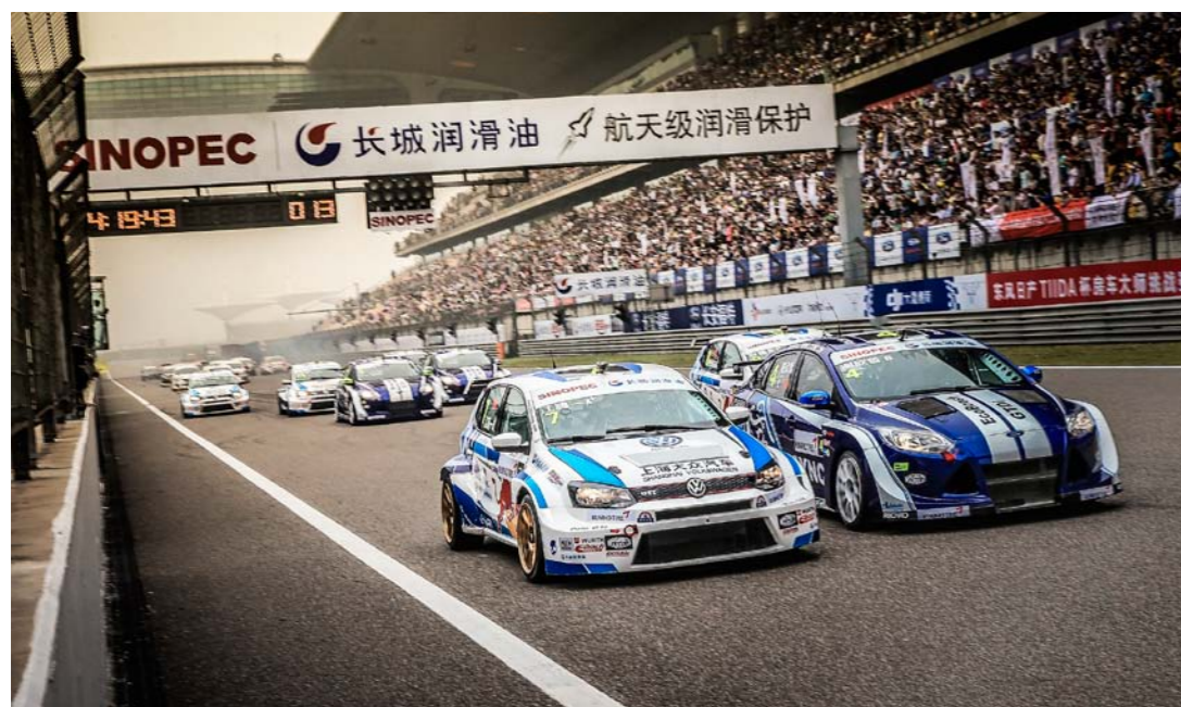
The Chinese Touring Car Championship has been a major success, with rounds at tracks such as the Shanghai International Circuit (left) attracting large crowds and big grids.