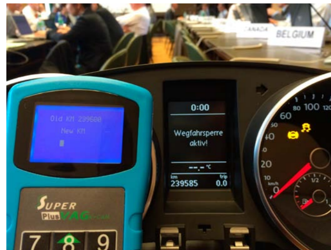
Every year mileage fraud costs €10 billion in Europe.