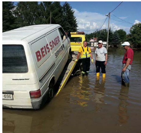
Floods caused devastation in many parts of Bosnia and Herzegovina.