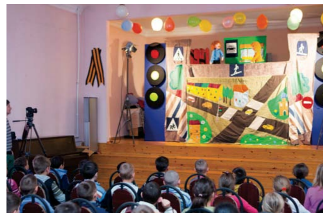
The ACM show promotes responsible behaviour on the roads.

To raise road safety awareness, the Automobile Club of Moldova (ACM) in collaboration with the National Patrol Inspectorate recently launched a road safety spectacle for children. On 8 May, children from the Moldovan capital, Chisinau, were received at the Foisor Fiermecat Theatre to enjoy the premiere of the show called 'Alex in the city'.