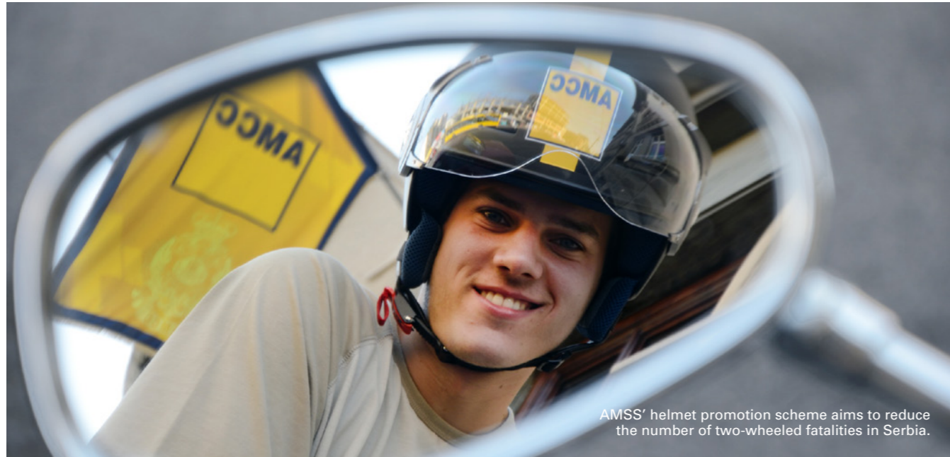
AMSS' helmet promotion scheme aims to reduce the number of two-wheeled fatalities in Serbia.

Automobile and Motorcycle Association of Serbia