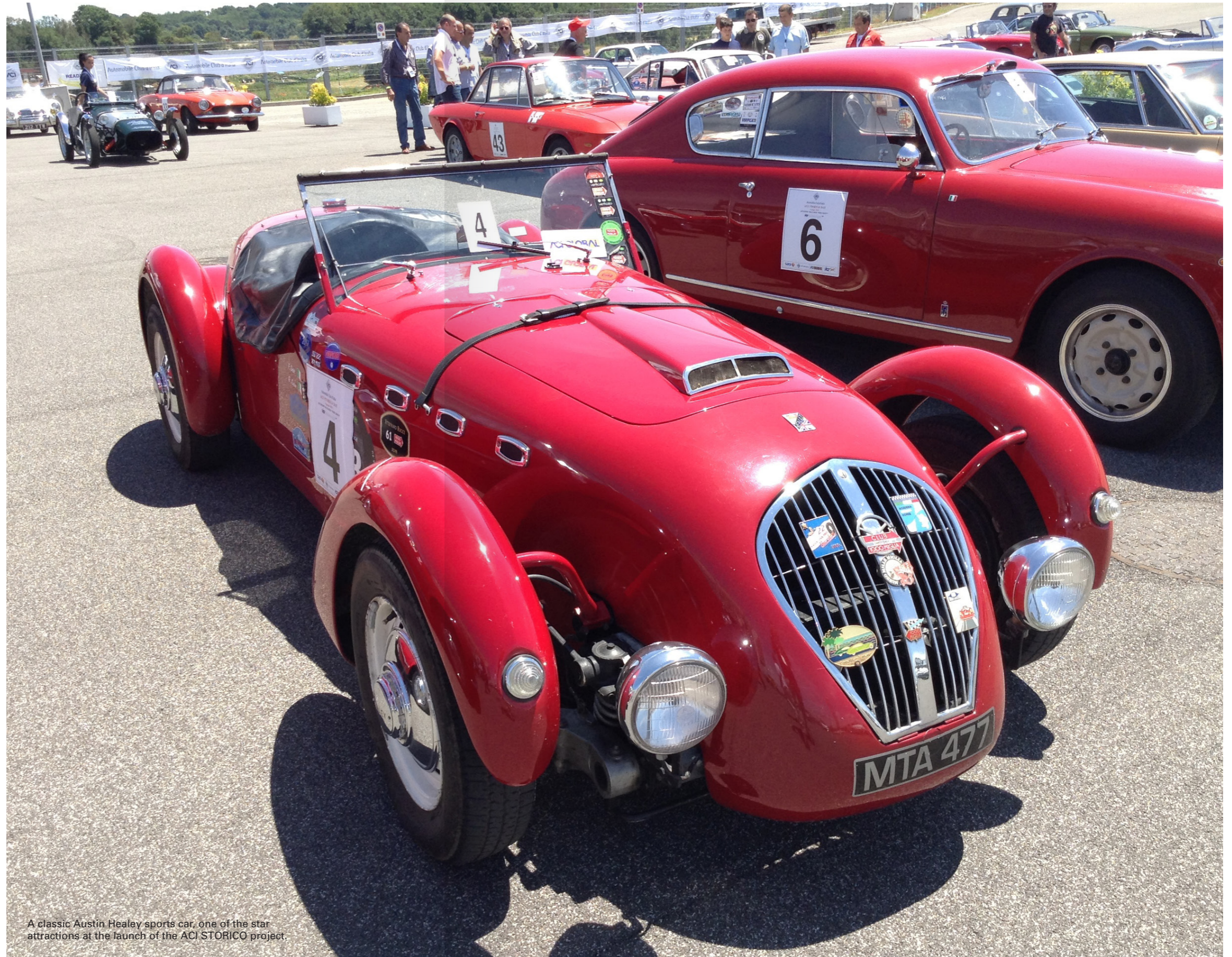
A classic Austin Healey sports car, one of the star attractions at the launch of the ACI STORICO project.

Among other benefits, membership of ACI STORICO will include entertainment opportunities as well as access to an online library featuring a wide range of documents, books, publications and historical records related to the nation's automotive past.