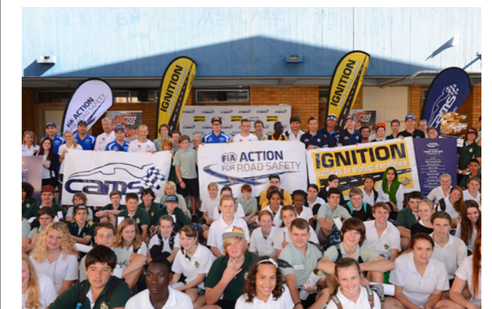
Pupils of the Orara High School in Coffs Harbour received some safe driving tips from the stars of the World Rally Championship.