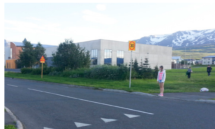
Iceland's FÍB is calling for clearer marking on pedestrian crossings in a bid to protect children walking to and from school.