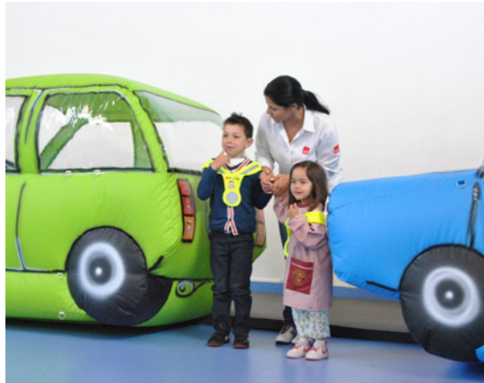
A scene from the ACP's child-focused safe road use TV campaign 'One Safety Minute Kids'.