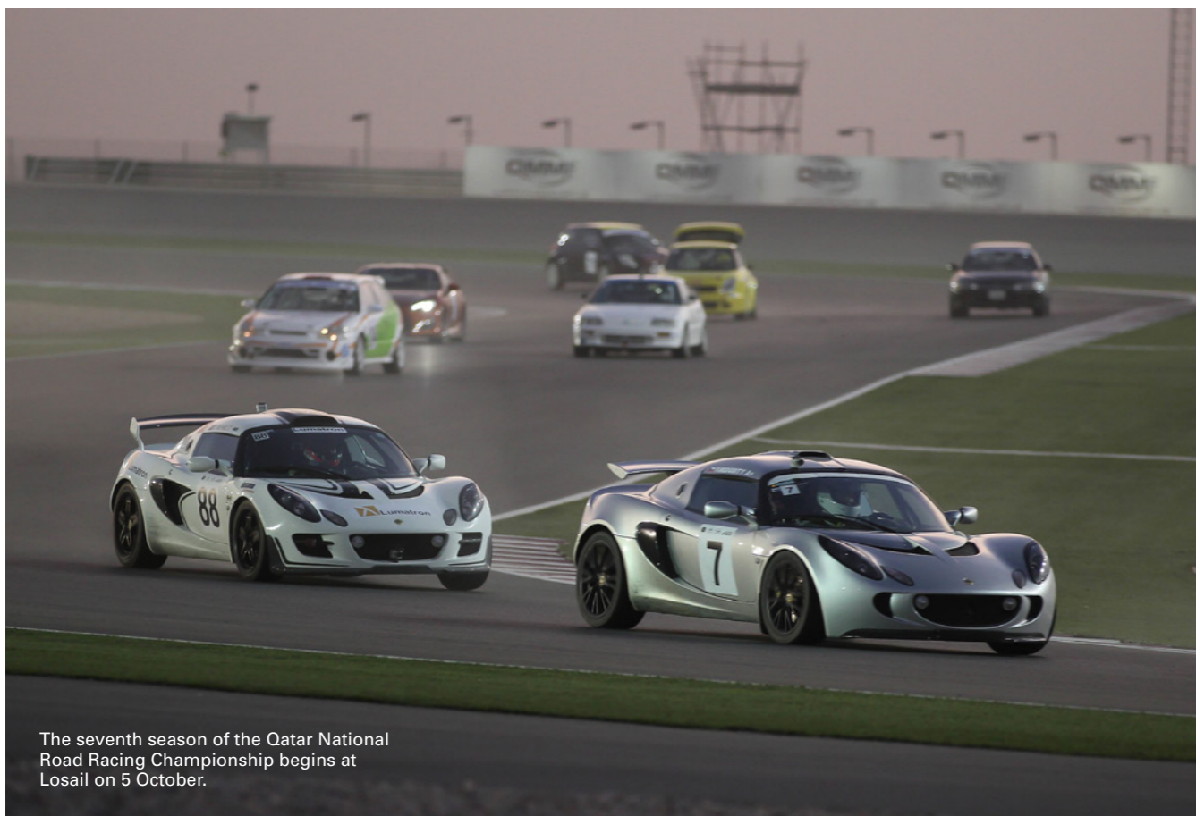
The seventh season of the Qatar National Road Racing Championship begins at Losail on 5 October.