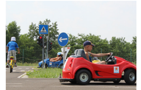
MNASZ's Driving Centre is this year focusing on teaching youngsters safe road use.