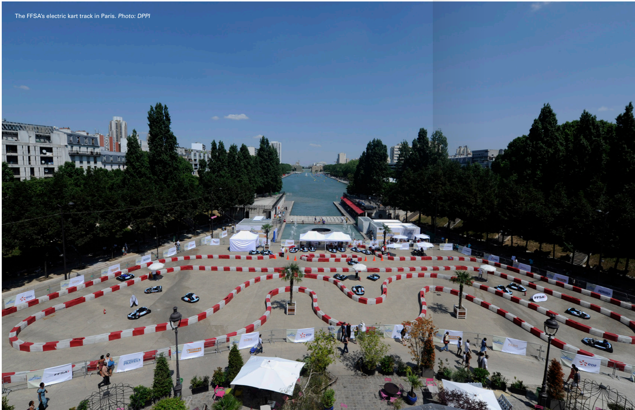
The FFSA's electric kart track in Paris.

Fédération Française du Sport Automobile