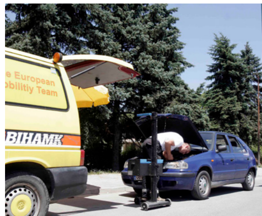
BIHAMK found that just 55% of vehicles tested during its Travel Safety programme met acceptable standards.