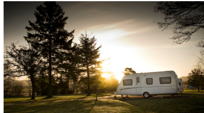
Britain's CCC says there is no evidence to suggest roadworthiness testing of caravans will make roads safer.