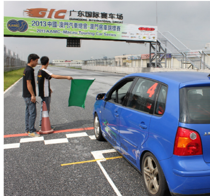
The HKAA's Young Driver Safety programme now includes motor sport safety advice.