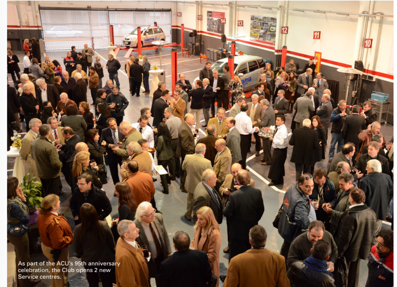
As part of the ACU's 95th anniversary celebration, the Club opens 2 new Service centres.