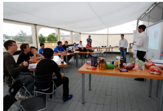
Aspiring racing drivers are given Anti-Doping advice at one of the MSA's Performance Master Classes.