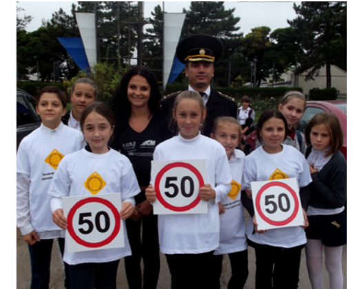
Moldovan children present their 'Speed Limit 50' signs as part of the ACM's safety campaign.